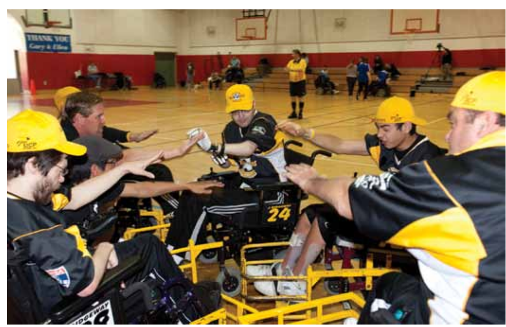
The Rollin' Gauchos gear up for a tournament

One Sunday in April, players from California and Arizona carefully watched opposing teams kick off the initial game in an all-day tournament. The first competitive team sport developed specifically for power wheelchair users, Power Soccer draws athletes with disabilities including quadriplegia, multiple sclerosis, muscular dystrophy, and cerebral palsy. Adapted from US soccer or English football, the game is played in a gymnasium by two teams of four players with a 13-inch soccer ball.