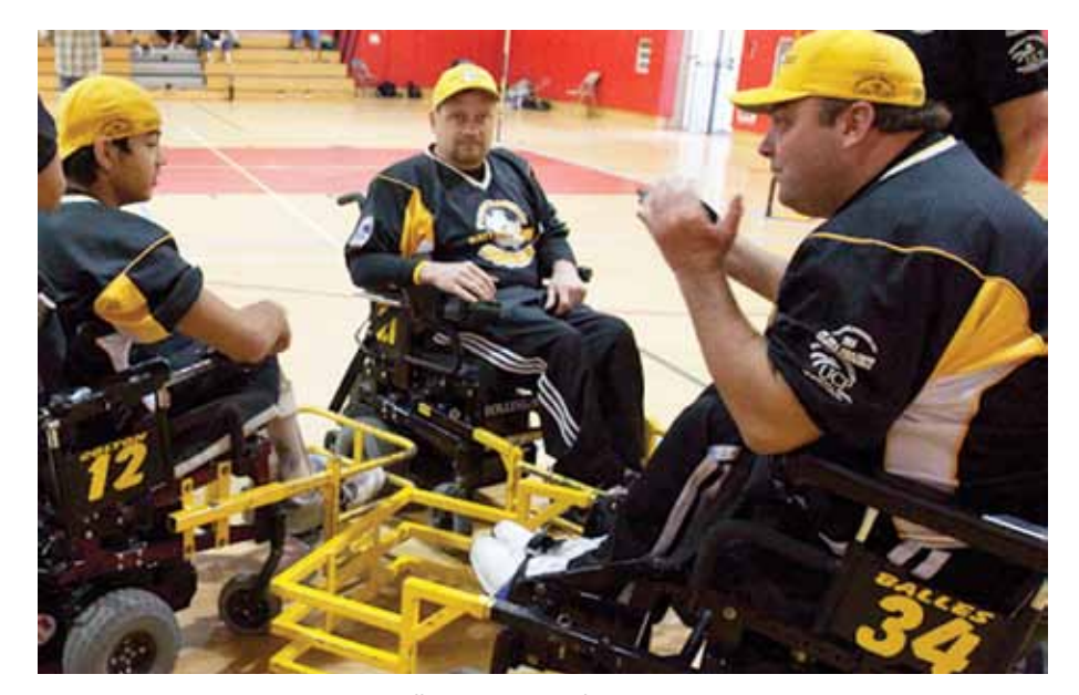
Balles strategizes with teammates