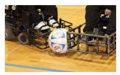
Players vie for the ball